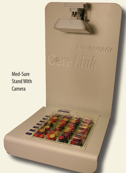
Med-Sure Stand With Camera

When the client lifts the blister pack from the stand, it triggers a video clip which is sent to caregivers via e-mail. They can then easily view which medication was taken (Monday morning, Tuesday noon, Saturday evening...). If the correct medication was taken, then the caregiver does nothing. All is well. However, if the incorrect medication was taken, then the caregiver needs to take corrective action which includes removing the pills that were supposed to be taken so as to prevent the client from taking a double dose that day.