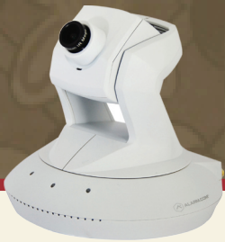
360° Pan Tilt Camera